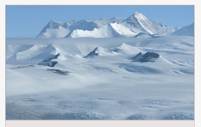
The Ellsworth Mountains.

The Advance Party team paved the way for this mission by transporting the drilling equipment more than 250km through the Ellsworth Mountain range, over deep-snow terrain and crevasses to the Lake Ellsworth drilling site. The final leg of this journey was the most challenging and required powerful tractors to tow heavy containers of equipment on sledges and skis, forming a 'tractor-train'. The soft, deep snow and concrete-hard 'sastrugi' snow forms caused the Advance Party's progress to slow, but after three days they safely reached the Lake Ellsworth drilling site.