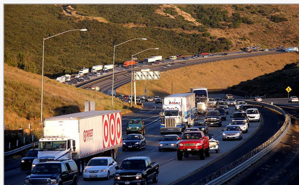
Traffic jams, and associated vehicle emissions, are a present problem in the Los Angeles area.

Hudda, N. et al.: Efficient determination of vehicle emission factors by fuel use category using on-road measurements: downward trends on Los Angeles freight corridor I-710 , Atmos. Chem. Phys. , 13, 347–357, 2013