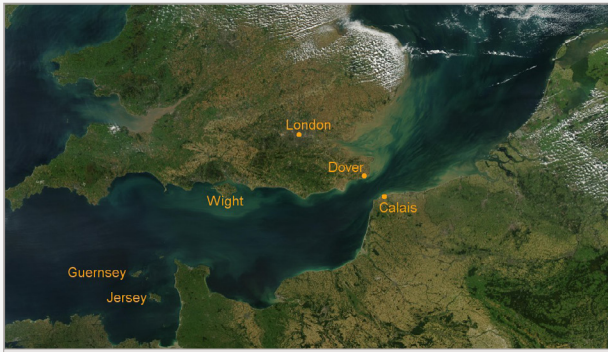
English Channel from above.