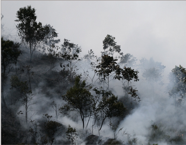
Biomass burning in southern Ecuador