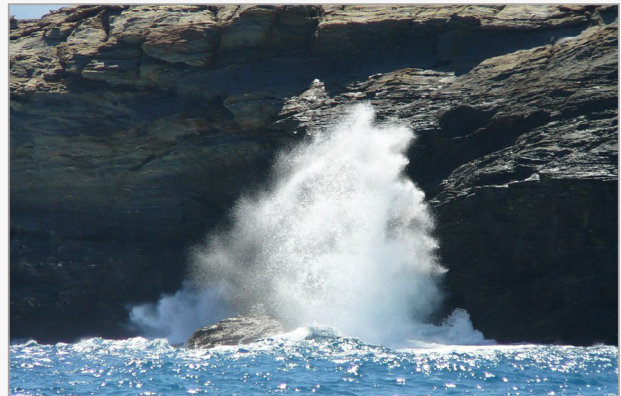
Sea-spray aerosol, generated through bubble bursting in whitecaps, is one of the most important natural aerosol systems.