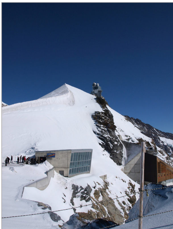
The dome of the Jungfrauoch atmospheric observatory in Switzerland is seen in the distance in this photo.

to agricultural practices, variability of wetlands, and changing fossil fuel emissions being likely factors.