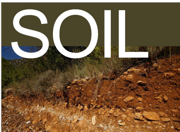
Journal SOIL cover detail