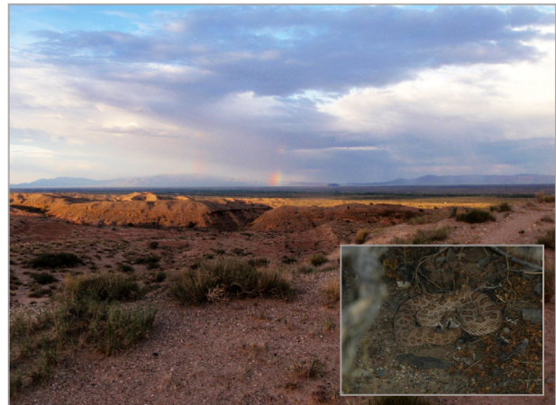
View across the Sevilleta National Wildlife Reserve, in the Chihuahuan desert in New Mexico, USA. Inset: rattlesnake beneath a creosote bush where Cunliffe had wanted to collect a soil sample.

Soil components can roughly be separated into three parts: coarse, medium and fine. Generally, it’s thought that there’s no organic carbon to be found in big soil particles (those greater than 2 mm), and little in medium-sized ones (0.25–2 mm). However, Cunliffe’s findings have shed new light on the distribution of organic carbon across soil aggregates. While fine soil particles (those under 0.25 mm) have relatively high concentrations of organic carbon, a finding in line with soil other science research, the medium-sized particles were surprisingly rich. The biggest particles were the biggest surprise, containing a similar concentration of organic carbon as the smaller (sub 2 mm) aggregates. The amount of carbon stored in scrubland soils could be severely underestimated if these size fractions are ignored.