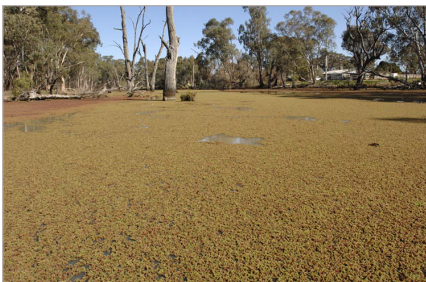
Azolla growth in Broken Creek near Cobram in Victoria, Australia.

takes place in isolated tanks where nutrients can be reclaimed from wastewater streams and fed back into the next batch. Heat speeds up the process, but that could come from unexpected sources. On an industrial scale, Bijl envisions coupling Azolla production facilities to industrial operations like concrete factories or steel plants where heat and CO 2 abound.