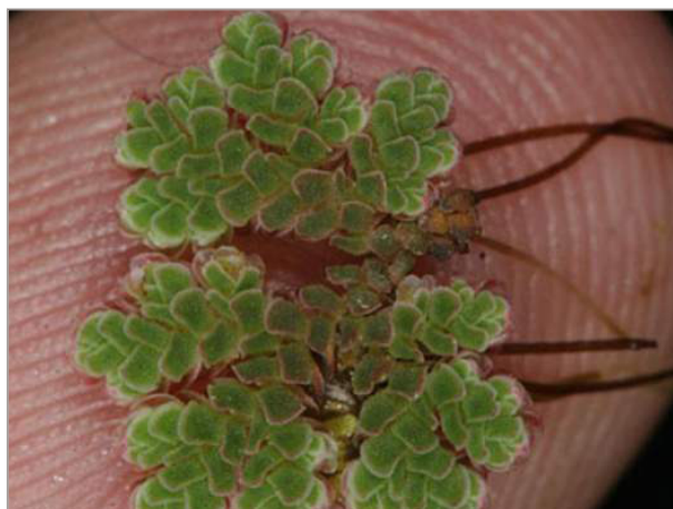
Azolla filiculoides close up.