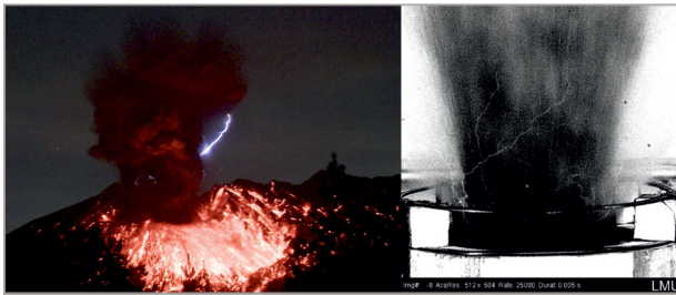
Left: Volcanic lightning at Sakurajima volcano in Japan. Right: Volcanic lightning recorded by a high-speed camera in the lab.

There’s also a very practical application in the form of hazard management. “We cannot predict the eruption, but we can tell something about the structure of the plume and the fate of the ash from the plume. But we need to couple this technique with other monitoring,” says Cimarelli. This is where the sounds come in. “During monitoring at night our camera can’t see the very beginning of the eruption, but we can spot it because of the sound. So we can synchronise our camera with the microphone and then use the microphone signal to look in the video to find the beginning of the eruption.” These techniques are being used in collaboration with researchers at the Universities of Kyoto and Kyushu in Japan.