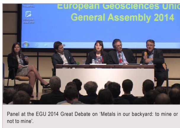
Panel at the EGU 2014 Great Debate on 'Metals in our backyard: to mine or not to mine'.

Activities of the Geochemistry, Mineralogy, Petrology & Volcanology Division (GMPV) encompass a broad range of geoscience disciplines. A major focus is the solid Earth, and a series of processes that starts with mantle geodynamics, extends through the formation of magma and its evolution in the crust, and terminates with volcanic eruptions. In addition, the mineralogy group deal with metamorphism and the geochemists study processes ranging from mantle evolution to the chemical record of climate change.