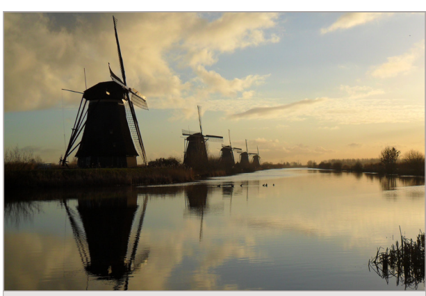
Historically, windmills have been used for keeping the water levels down in polders in the Netherlands.

used in the geoscientific sense: as a synonym for a forecast, or a number of alternative forecasts or projections each of which includes (rather than excludes) the main uncertainties. This kind of scenario approach is often used in water management with certain assumption on water demand, water availability, and their spacetime distribution. On the basis of these scenarios (and other factors such as politics) decisions are taken to manage the water resources in some optimum way.