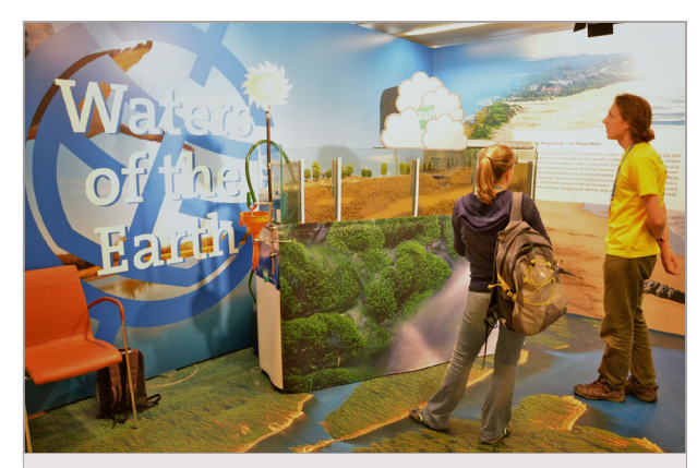
Model of the terrestrial hydrological cycle at the EGU 2014 General Assembly, by the Leibniz Centre for Agricultural Landscape Research.

"Panta Rhei is dedicated to research activities on change in hydrology and society. The purpose of Panta Rhei is to reach an improved interpretation of the processes governing the water cycle by focusing on their changing dynamics in connection with rapidly changing human systems. The practical aim of Panta Rhei is to improve our capability to make predictions of water-resource dynamics to support sustainable societal development in a changing environment. The concept implies a focus on the hydrological system as a changing interface between environment and society, whose dynamics