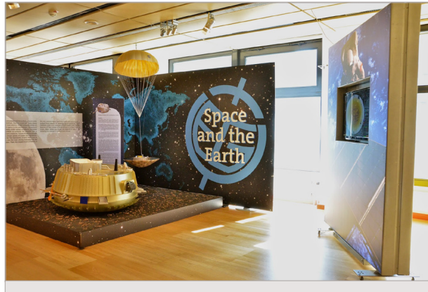
Space and the Earth exhibition area at the EGU 2014 General Assembly

During the EGU 2014, a number of young scientists from the PS division volunteered to help at different domains including the programme, publications and outreach activities. Thanks to their initiatives it is now possible to follow the news and updates from the EGU