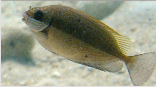
One of the rabbitfish responsible for severely degrading algal forests in the eastern Mediterranean.

how human activities have helped spread non-native species in the Mediterranean. While the canal provides a highway for marine migration, alien species don't have to make the journey alone and many hitch a ride on shipping vessels, either on their hulls or in their ballast water, bringing new species to far stretches of the Mediterranean Sea. Some 300 species have made it to the Med as stealthy passengers and have established themselves around the sea's major ports and harbours.