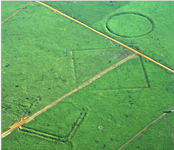
Geoglyphs on deforested land at the Fazenda Colorada site in the Amazon rainforest.

Furthermore, they appear to be widespread: as much as ten percent of Amazonia may be covered by anthropic black soils.