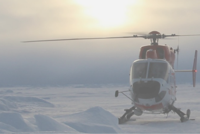
Helicopter-borne maps with 1 m resolution