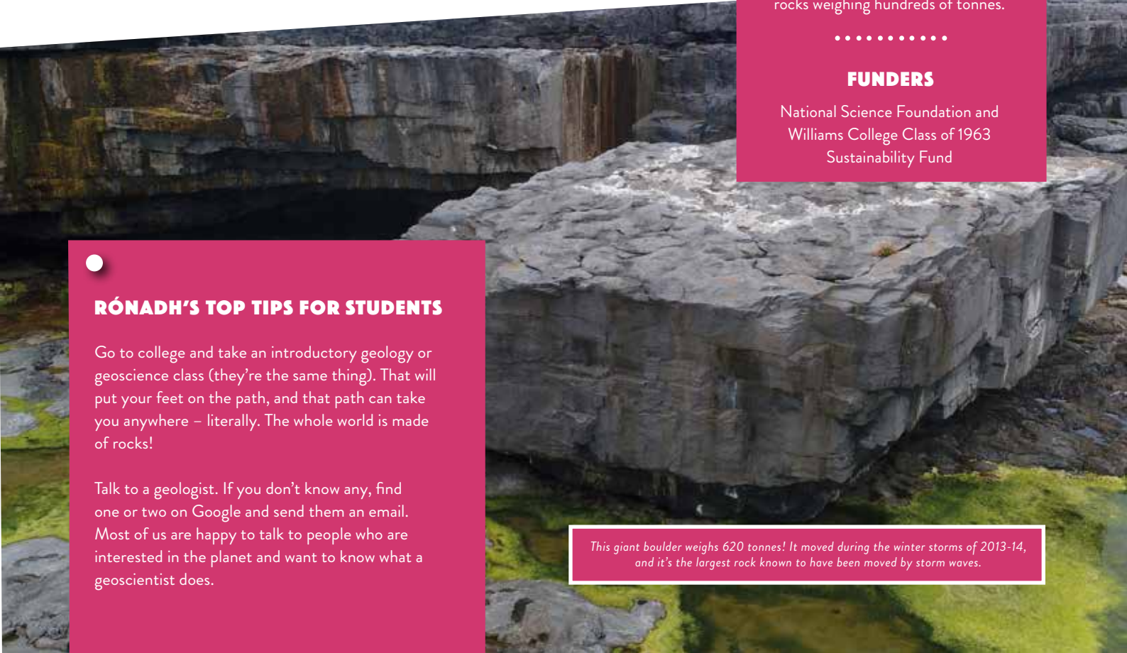
This giant boulder weighs 620 tonnes! It moved during the winter storms of 2013-14, and it's the largest rock known to have been moved by storm waves.

boulders as heavy as six blue whales – or heavier. The largest boulder on the Aran Islands weighs more than 700 tonnes. It didn't move during the 2013-14 storms, but evidence shows that it moved in the past. If scientists are to accurately understand and predict risks associated with living in coastal areas, understanding boulder transport is vital. And the world needs more geologists to work on these problems!