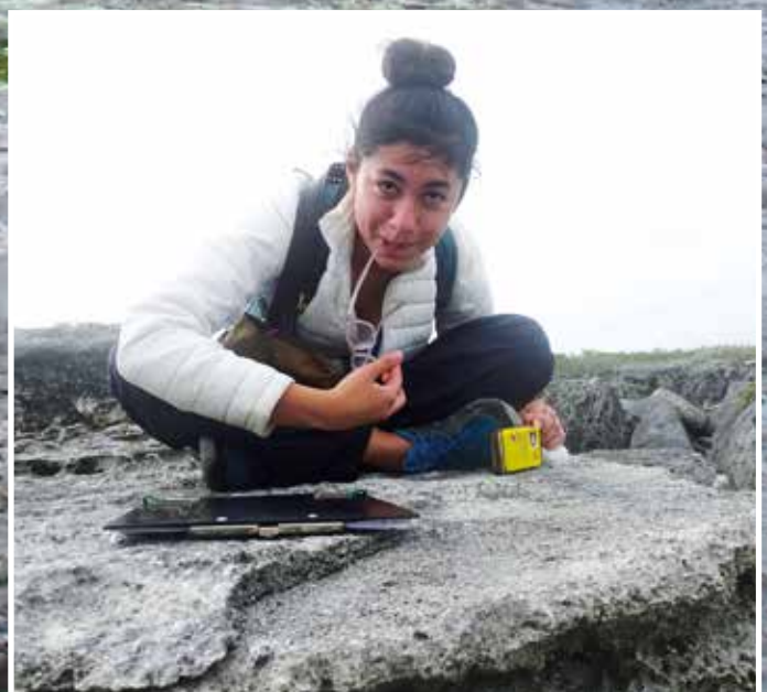
Meet JoJo. She's on a field expedition studying boulder erosion. You can be a field geologist, too, and measure the natural world.