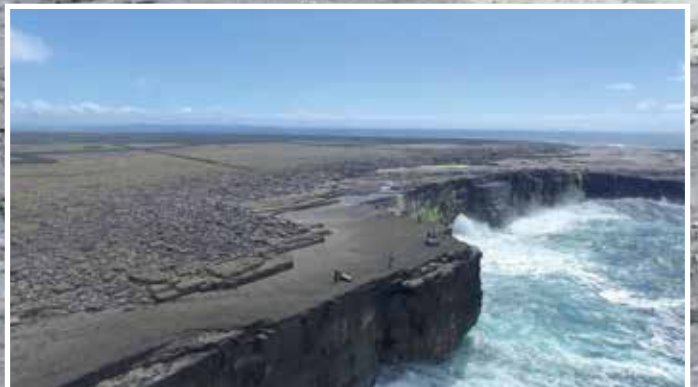
Piles of boulders sit on top of 40 m cliffs, 25 m inland from the edge. To understand the scale of this, look at the people near the cliff edge.