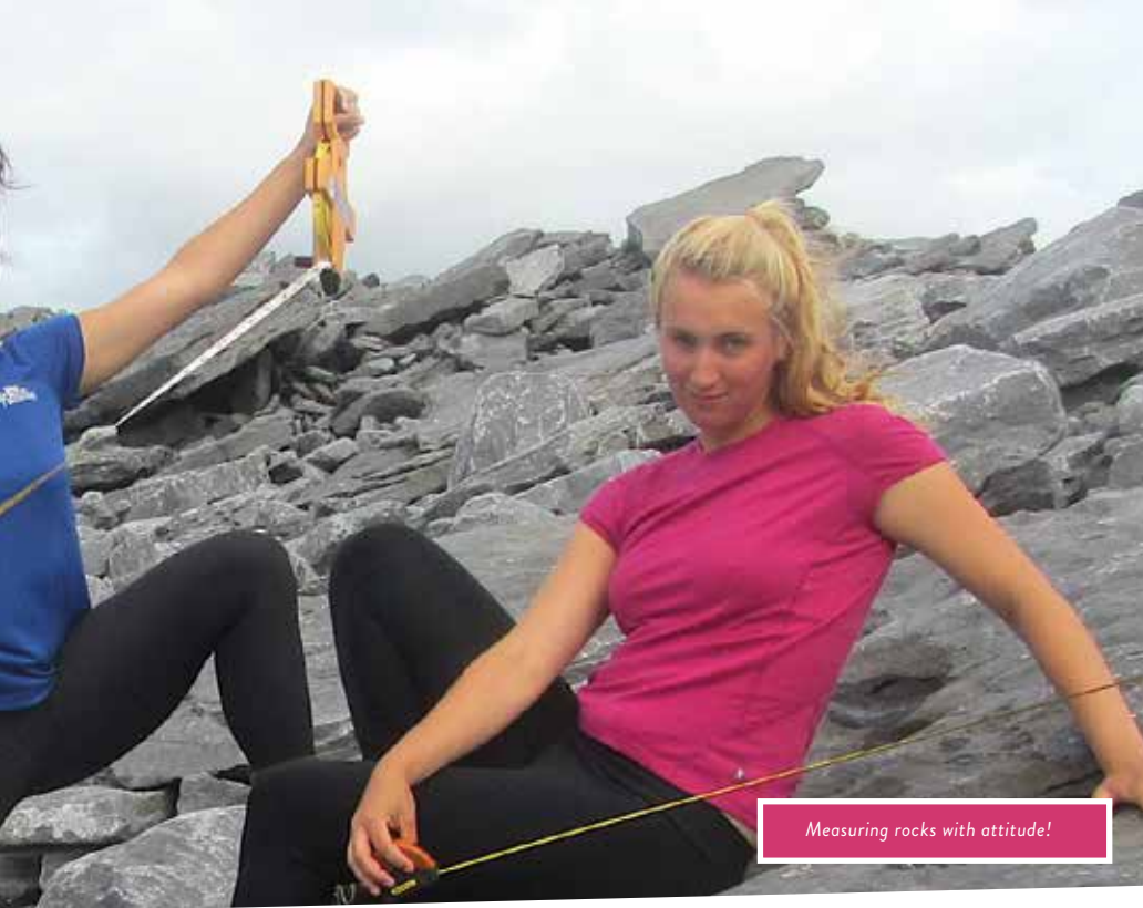
Measuring rocks with attitude!