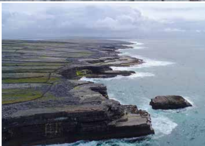
Along the Aran Islands' Atlantic coast, there are 15 km of boulder deposits.