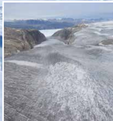
A small, 1km-wide glacier flows into the ocean in southeast Greenland.