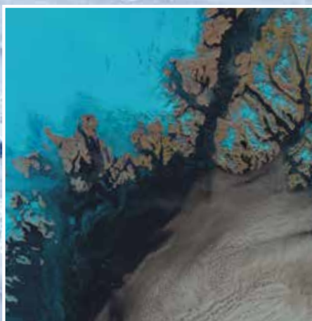
Landsat 8 satellite image of southeast Greenland from July 2014. This is a 'false colour' image. The colours aren't what you would see in the real world but in this image the ocean is black, the clouds over the ocean are the wispy white areas, the land is brown, and the ice is blue. Bright blue is snow on the Greenland Ice Sheet and darker blues are glacier ice.

I recommend taking introductory physics and maths classes early on. A lot of students interested in geoscience are afraid that maths and physics are too hard for them. I actually didn't think I was very good at physics in high school and early in college, but once I started applying physics to the study of glaciers, I realised I just needed to be able to visualise it to understand its application better.