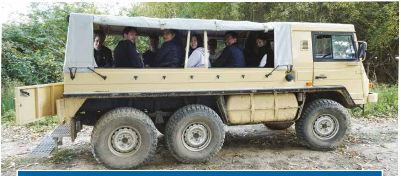
QMUL geography students take a trip in a Pinzgauer all-terrain vehicle.