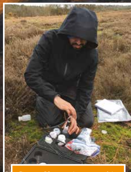
First-year BSc geographers, as part of the East Anglia field class, explored the long-term evolution of the coastline and the River Stour at Stutton Ness.

https://www.prospects.ac.uk/job-profiles/geochemist