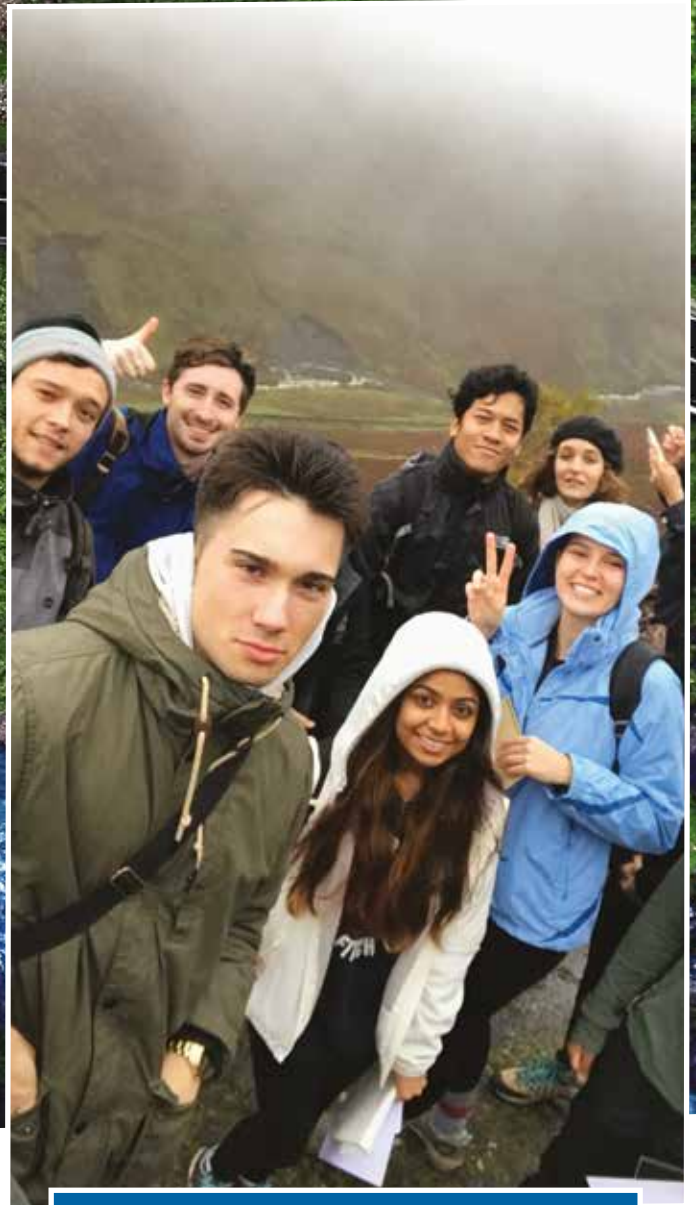
QMUL geography students on a field trip to the Lake District in the UK.