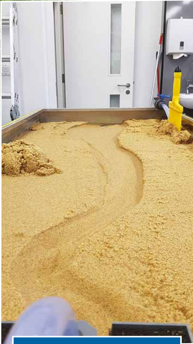
The river lab at QMUL's School of Geography.