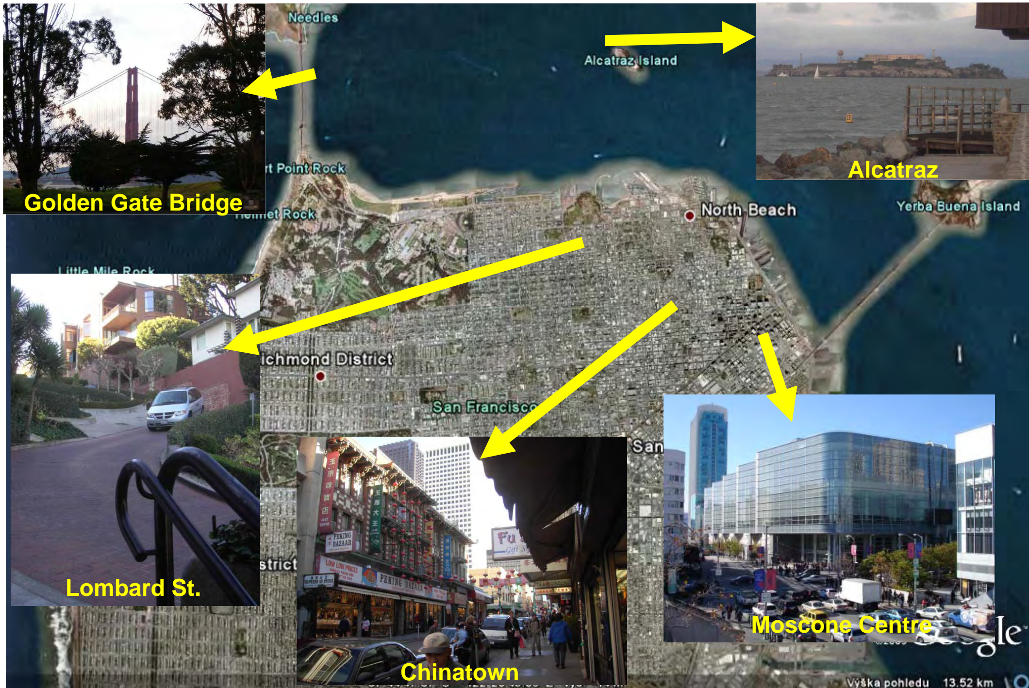
Golden Gate Bridge