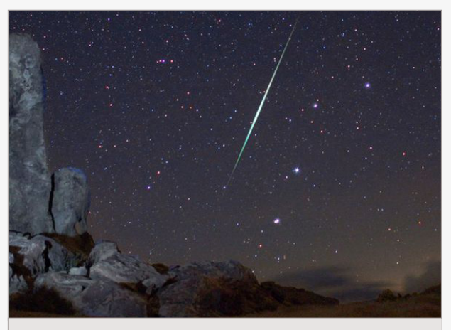
Geminid meteorover the Mojave Desert in 2009