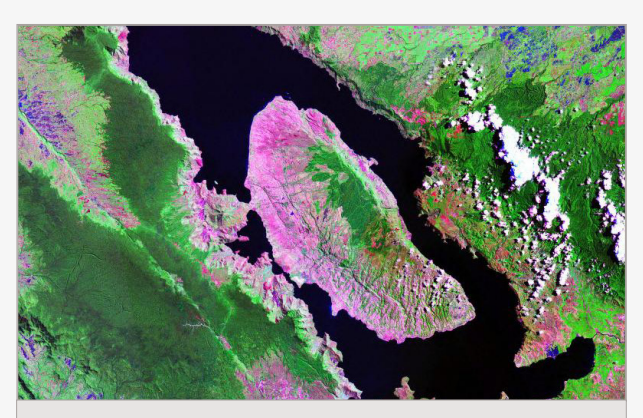
Lake and supervolcano Toba in Sumatra, Indonesia